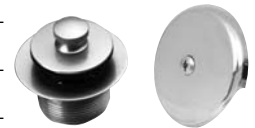
Decorator Finish Trim Kits include color-coordinated spud.