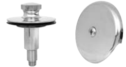
Chrome Finish Trim Kits do not include spud.