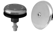
Chrome Finish Trim Kits do not include spud.